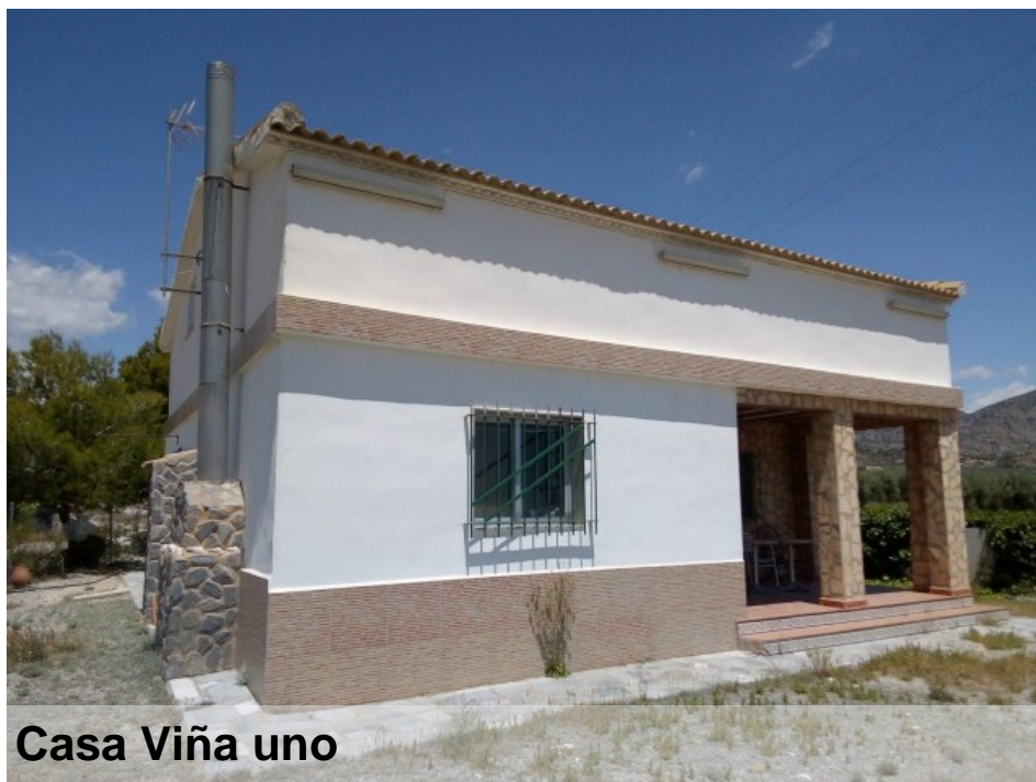
Casa Viña uno